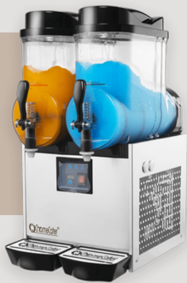
DOUBLE BARREL SLUSH MACHINE

INCLUDES 20 L OF SLUSH (80 X 250ML CUPS)