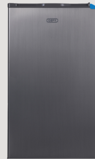
BAR FRIDGE SILVER DEFY