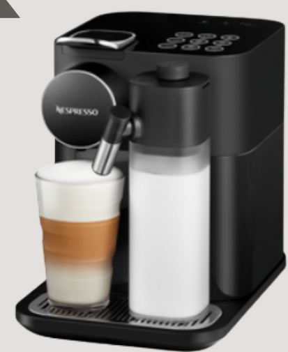
NESPRESSO GRAN LATTISSIMA MACHINE AND FROTHER