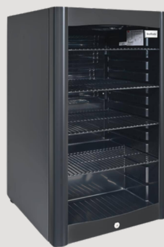
98L UNDER-COUNTER FRIDGE