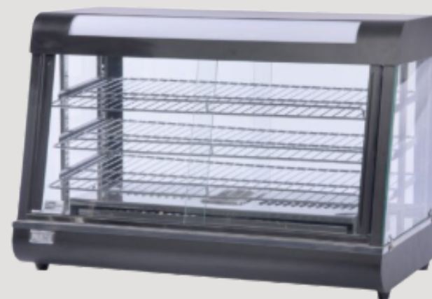
EQUIPMENT - FOOD DISPLAY WARMER QUANTITY - 1 SIZE - 66CM PRICE PER ITEM - R550