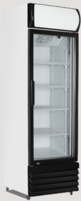
UPRIGHT DISPLAY FRIDGE - SINGLE

QUANTITY - 2 SIZE - 481L PRICE PER ITEM - R750