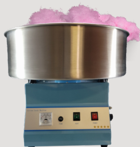
CANDY FLOSS MACHINE WITH SCOOP