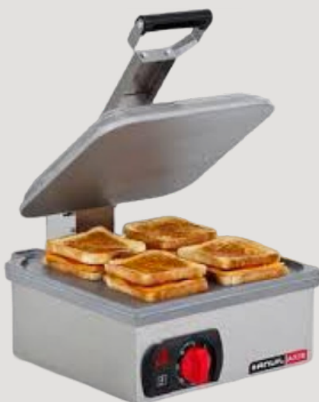
ANVIL FLAT TOP TOASTER QUANTITY - 1 PRICE PER ITEM - R600