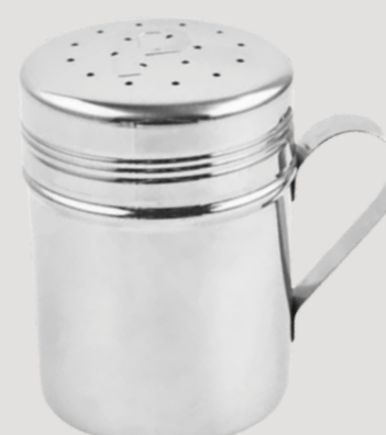
POPCORN ACCESSORY - SILVER SHAKERS