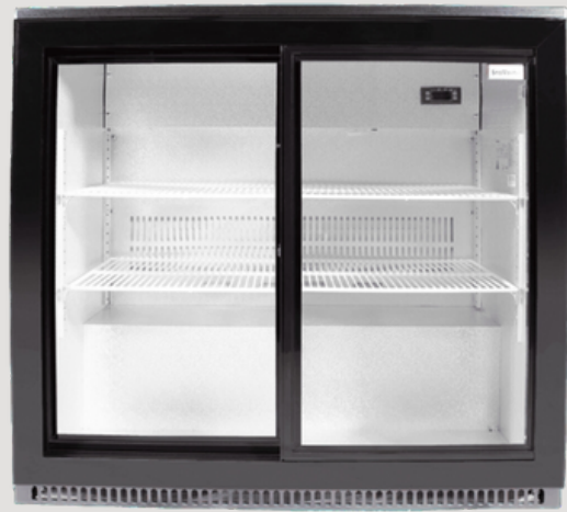
CATERING EQUIPMENT- UNDER COUNTER DOUBLE DOOR FRIDGE