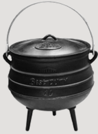
POTJIE POT SIZE 10 QUANTITY - 2 PRICE PER ITEM - R200