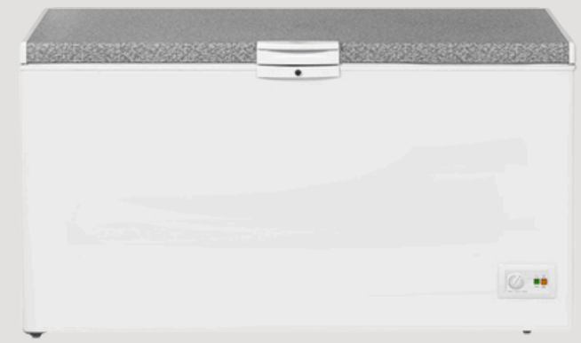
LARGE CHEST FREEZER

QUANTITY - 1 SIZE - 198L PRICE PER ITEM - R500