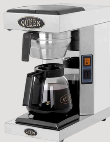
FILTER TEA & COFFEE MACHINE

QUANTITY - 1 SIZE - 2 X 10LITRE BARREL PRICE PER ITEM - R2000