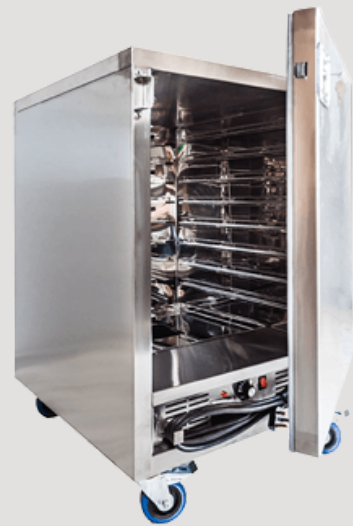
HOT BOX QUANTITY - 6 PRICE PER ITEM - R1000