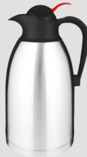
FLASK - VACUUM JUG

QUANTITY - 2 SIZE - 1.7L PRICE PER ITEM - R50