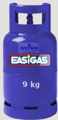
9 KG GAS BOTTLE QUANTITY - 29 PRICE PER ITEM - R395