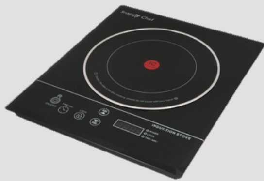
PLATE INDUCTION STOVE QUANTITY - 5 PRICE PER ITEM - R250