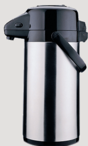
COFFEE / TEA - VACUUM FLASK

QUANTITY - 7 SIZE - 2.2L PRICE PER ITEM - R100