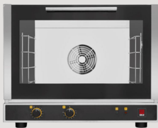
CONVECTION OVEN 4 PAN QUANTITY - 8 PRICE PER ITEM - R1500