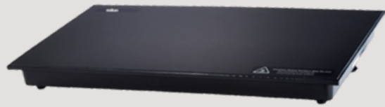
HOT TRAY QUANTITY - 3 PRICE PER ITEM - R150