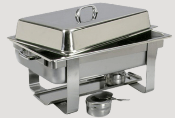
CHAFFING DISH WITH TWO FUEL BURNERS AND INSERT QUANTITY - 15 PRICE PER ITEM - R180