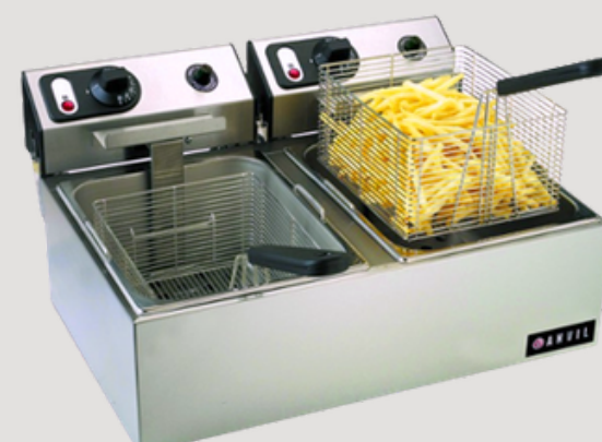
DOUBLE DEEP FRYER QUANTITY - 4 PRICE PER ITEM - R650