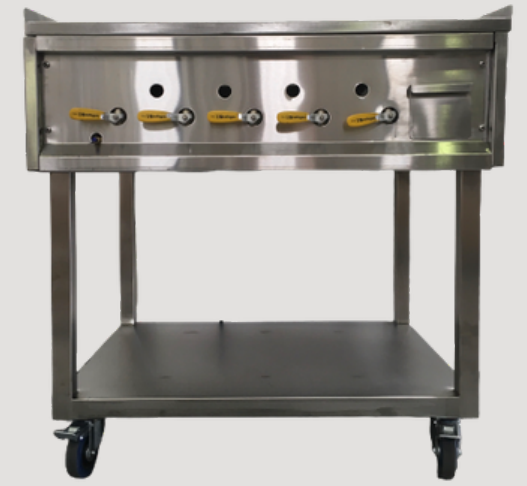
FLAT TOP GRILLER QUANTITY - 1 PRICE PER ITEM - R1500