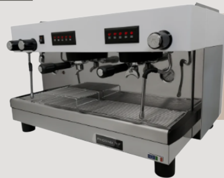
COFFEE MACHINE BARISTA AUTO 2GR