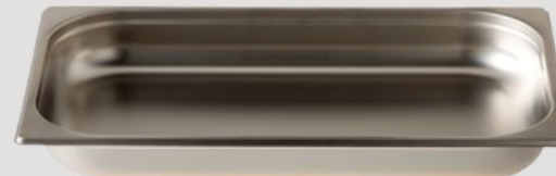
BAIN MARIE INSERTS QUANTITY - 4 PRICE PER ITEM - R100