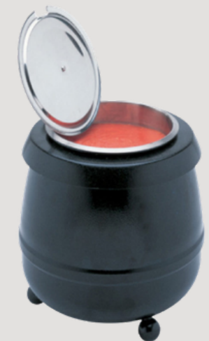
BLACK SOUP KETTLE QUANTITY - 3 PRICE PER ITEM - R250