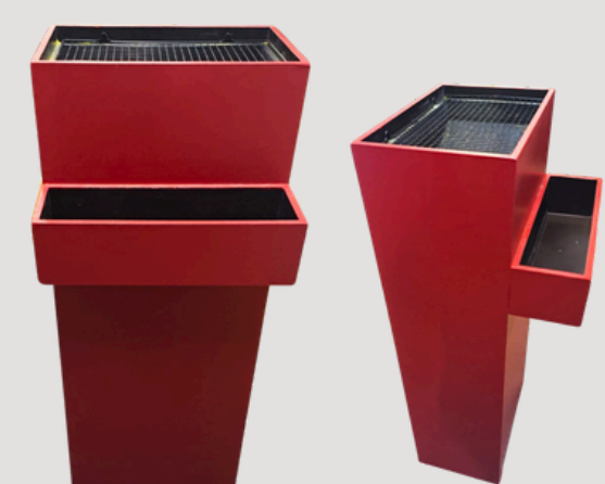
POPCORN SPICE STAND