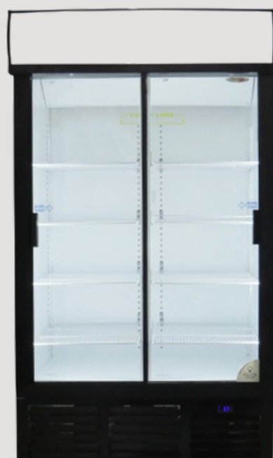
CATERING EQUIPMENT - DOUBLE DOOR DISPLAY FRIDGE