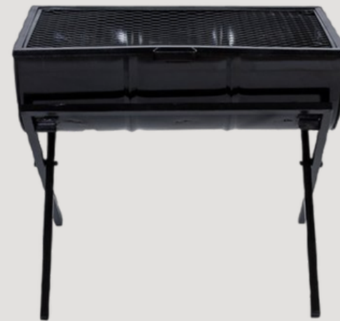
CHARCOAL BRAAI DRUM, GRID AND STAND QUANTITY - 6 PRICE PER ITEM - R320