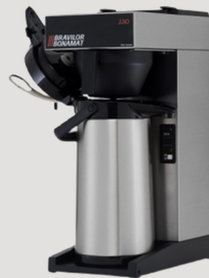
FILTER COFFEE MACHINE

QUANTITY - 1 SIZE - 20L PRICE PER ITEM - R300